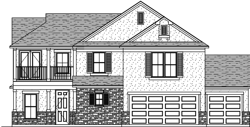
FRONT ELEVATION C 910 BASTIONE BELLA VISTA